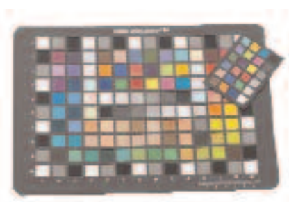
Eye-One digital ColourCheckers