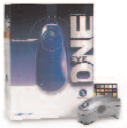
Eye-One XT is the most complete, full-scale colour management system